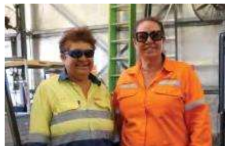
Sodexo and Naanda site visit to Gap Ridge mechanical workshop

We are happy to be on this journey with Naanda. It is an evolving journey that has been a learning experience for both Sodexo and Naanda.