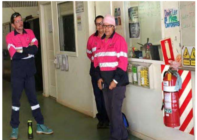
Cleaning Team Conducting Pre-Start

We also provide mentoring and support equipping people with skills for the future. If people decide down the track that they want to advance to another job, we encourage them to go for it. It means we can help someone else.